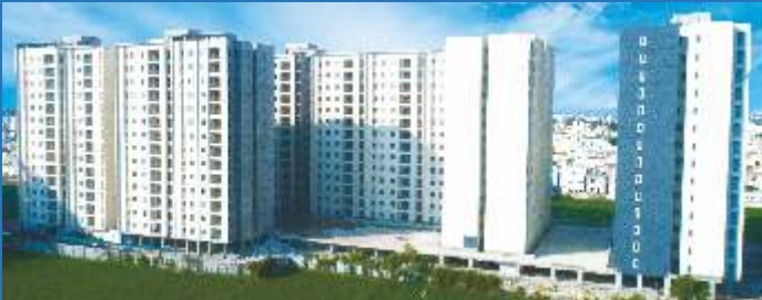
Construction progress as on Aug 2022

CASAGRAN Zenith is a wellness-themed community located in Medavakkam which offers 949 2 & 3 BHK apartments. The community offers 82 world-class amenities which also include wellness amenities like oxygen infused clubhouse, gym, indoor play and yoga/meditation room, Interactive gym with simulated wall and floor sensors, chlorine-free non-chemical pool system with aqua gym and many more. The community is strategically located 5 minutes away from Medavakkam junction. It is also close to the upcoming metro station, and areas like Sholinganallur junction, Velachery and Tambaram.