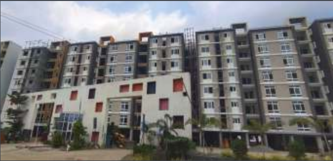
Construction progress as on Aug 2022

CASAGRAN Royale is a kids-friendly community located in Sholinganallur. The community offers 507 premium apartments spread across a sprawling 7.2 acres with 63% open space. CASAGRAN Royale is OMR's first kids-friendly project which features the maximum number of specially designed amenities for kids such as chalkboard wall, tot lot, ball pool, 3D Theater, video game room, comic corner, kids virtual games and a crèche.