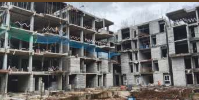
Construction progress as on Aug 2022

CASAGRAN Florella is Bengaluru's first Bali-styled smart villa community. The project offers 34 luxurious 3 & 4 BHK villas on 1.65 acres at Sarjapura, 20 minutes from Wipro SEZ. The project offers 25+ lifestyle amenities & features like rooftop swimming pool, amphitheatre, Balinese garden & many more.