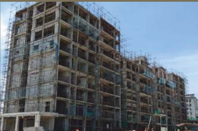
Construction progress as on Aug 2022

Located 10 minutes from Anna Nagar Roundtana, CASAGRAN Millenia comprises of 146 luxuriously crafted signature 3 BHK, 4 BHK & 5 BHK duplex apartments on 3.46 acres in Mogappair. The property offers 50 world-class lifestyle amenities swimming pool, sculpture court, mini hockey rink, informal seating, pergola structure and many more.