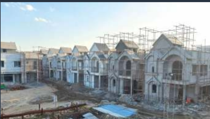
Construction progress as on Aug 2022

CASAGRAN Grandiô comprises of specially crafted 120 beautiful 3 and 4 BHK villas on 7.38 acres at Navalur, 10 minutes from Sholinganallur. The property is surrounded by IT/ITES companies, close to schools and colleges. The property offers 65% open space and a grand clubhouse of 6800 sq.ft hosting many indoor amenities along with other amenities.