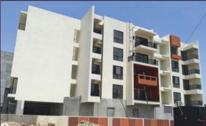
Construction progress as on Aug 2022

CASAGRAN Utopia is a kids-themed community, located in Manapakkam. Situated just 10 minutes away from Kathipara, the project offers a whopping 80+ amenities for residents. It is connected to major IT hubs, educational institutions, hospitals and metro stations.